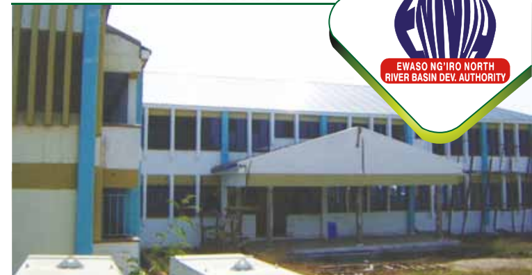
Activities Undertaken By The Authority In Meru County